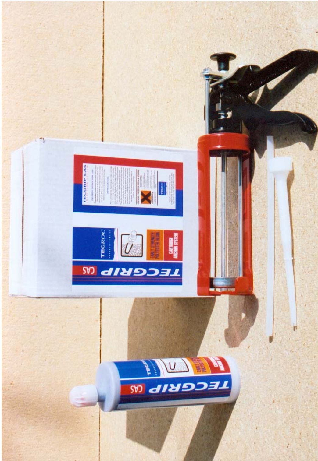
TECGRIP CAS CARTRIDGE, NOZZLE MIXER, EXTENSION TUBE & GUN