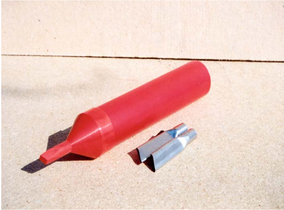
CARTRIDGE & NOZZLES FOR USE WITH PUMPABLE MORTAR