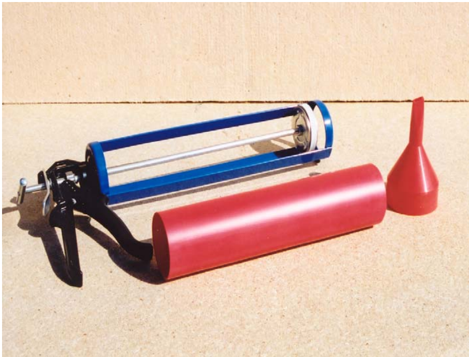
HAND PUMP FOR USE WITH PUMPABLE MORTAR: GUN, CARTRIDGE & NOZZLE COMPLETE

Head Office Holly Lane Industrial Estate Atherstone Warwickshire CV9 2RN Tel: 01827 711755 Fax: 01827 711330