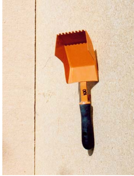
THIN JOINT MORTAR NOTCHED TROWEL APPLICATOR